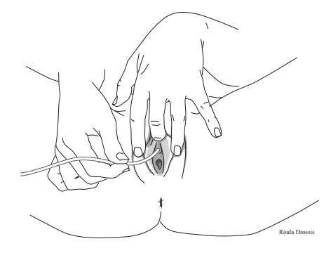
View of left hand spreading the labia with right hand inserting a catheter into the urethra

7. Using your dominant hand, slowly insert the catheter into the urethra until urine begins to flow (about 5 cm or two inches). It is important to breathe slowly and relax your muscles. Advance the catheter another 3 cm (about