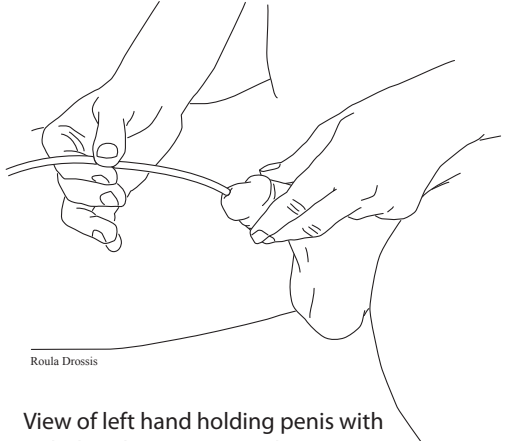
right hand inserting a catheter

flow. There may be slight resistance at the level of the sphincter and prostate. It is important to breathe slowly and relax your muscles. Advance the catheter another 3 cm (about one inch) to ensure that the tip is well into the bladder.